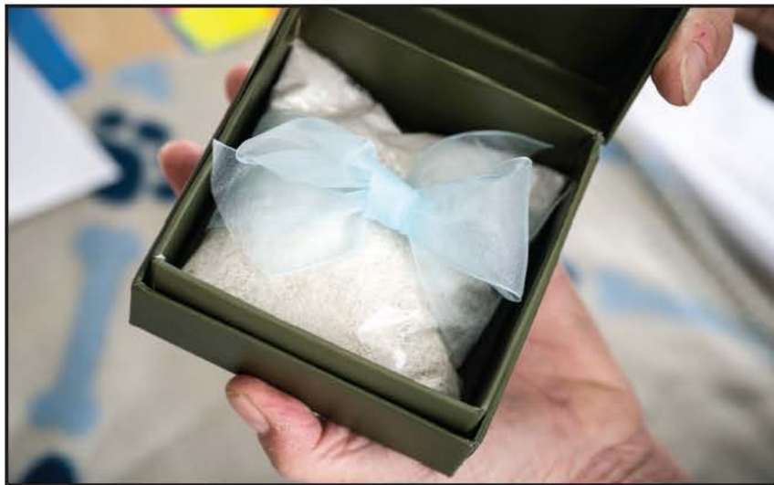
The remains of the a beloved pet are treated with respect and dignity at Peaceful Pets, and are hand delivered to the grieving owner by a member of the Peaceful Pets team.

Until recently, pet owners had a single option for handling the remains of a beloved dog or cat -- cremation, a process that spews toxic fumes into the atmosphere, requires a considerable amount of energy, and is often provided by operations akin to refuse removal services. Today, Southern California pet owners and veterinarians have an entirely better way to say goodbye to their animal companions.